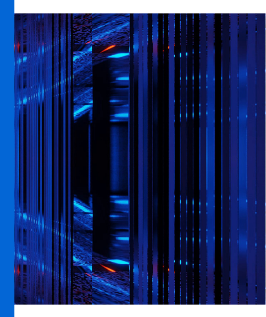
BUSINESS MISSION OVERVIEW